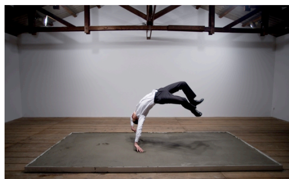
fig. 2 "infinity" (2006); HDV, 04:38 min., courtesy of Takuro Someya Contemporary Art, copy right(c) Mai YAMASHITA + Naoto KOBAYASHI